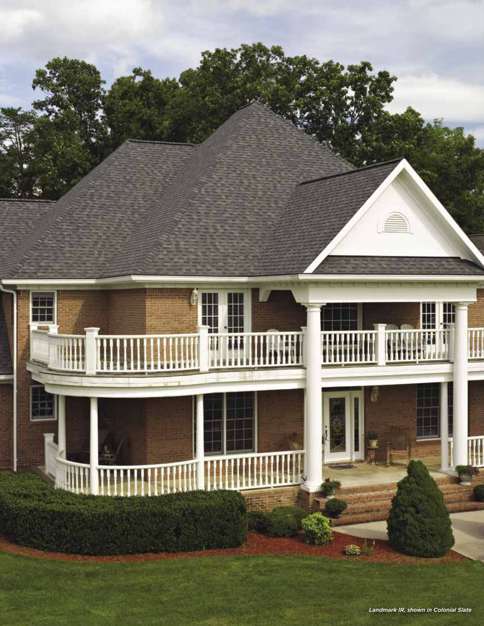
Landmark IR, shown in Colonial Slate